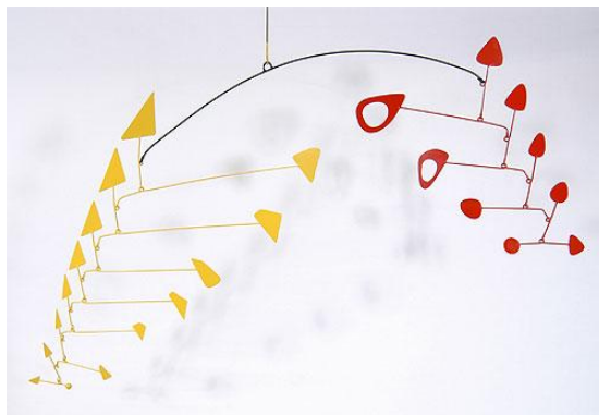
Artist: Bruce Gray